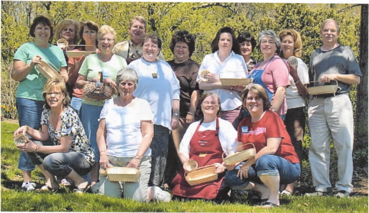
+++ A FANTASTIC WEEKEND OF WEAVING! +++